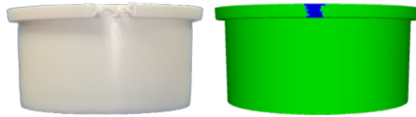
Figure 1: Highlighted in blue detected volumetric missing volume on a defective plastic coffee capsule.

A surface analysis [10] is facilitated through the training of a specialized model to learn image descriptors for each point within the 3D model through an automated training process using a reduced set of pre-validated samples [11]. For each 3D point, the cameras with the best viewing angle are evaluated and small image cropping of a predefined size are assigned, establishing a texture model with spatial reference that comprehensively captures the details of the surface at that point. The subsequent comparison between the textures acquired during the capture process and those learned by the model yields a metric quantifying the distance between the two sets of surface representations. This metric serves as a discerning tool for evaluating surface variations, providing accurate information about the fidelity of the captured surface texture with respect to the learned model.