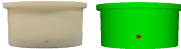
Figure 2: Highlighted in red detected surface defect spot on a plastic coffee capsule.

A surface analysis [10] is facilitated through the training of a specialized model to learn image descriptors for each point within the 3D model through an automated training process using a reduced set of pre-validated samples [11]. For each 3D point, the cameras with the best viewing angle are evaluated and small image cropping of a predefined size are assigned, establishing a texture model with spatial reference that comprehensively captures the details of the surface at that point. The subsequent comparison between the textures acquired during the capture process and those learned by the model yields a metric quantifying the distance between the two sets of surface representations. This metric serves as a discerning tool for evaluating surface variations, providing accurate information about the fidelity of the captured surface texture with respect to the learned model.