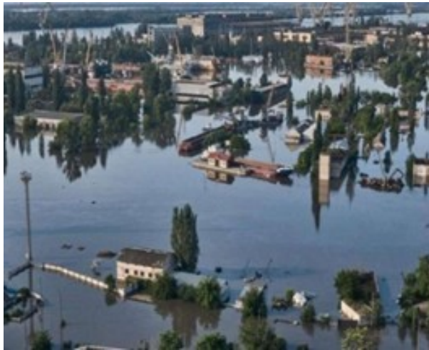
The Kakhovka hydroelectric power station explosion: structural devastation and immediate aftermath [3]