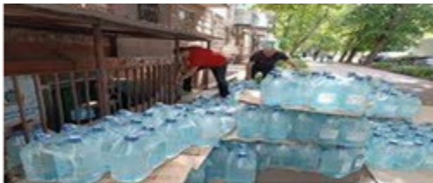
Destruction of the Kakhovka hydroelectric power station: draining of an 18 km 3 reservoir and flooding of 584,000 hectares of farmland [4]