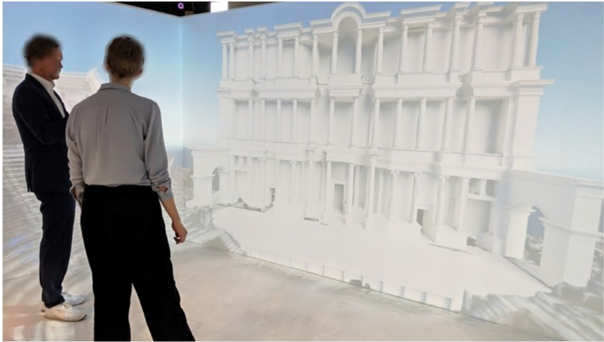
Figure 7: Immersion of scholars into a 3D scene of an ancient theater. Fictitious data is shown in gray color (see https://www.csmc.uni-hamburg.de/artefact-lab/computer-science-lab/human-interaction.html ).