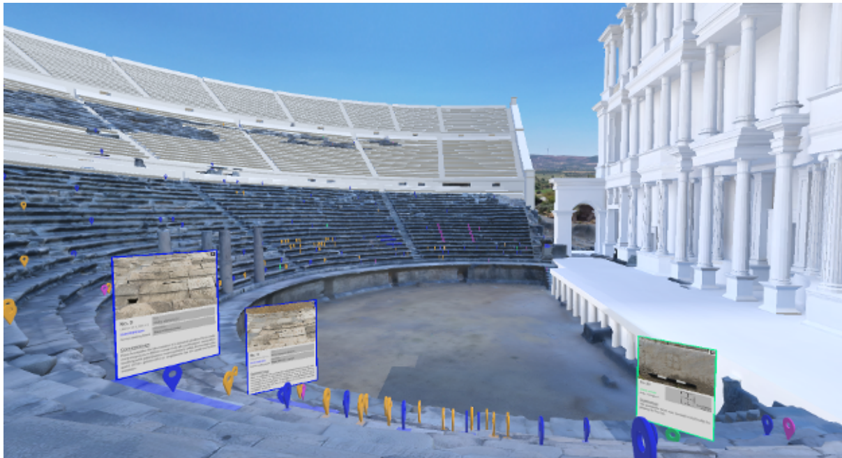
Figure 6: Miletus theater (Roman empire) (see https://www.csmc.uni-hamburg.de/research/cluster-projects/completed-cluster-projects/rfb02.html ).

Visually displaying information has to follow different rules. As an example, we also consider inscription data, but this time data about inscriptions that are found, e.g., on the seats in a theater at Miletus. 4 The theater was scanned, and the 3D data is shown in Figure 6. Note that in the example we discuss, data from 3D scans (dark gray) are augmented with fictitious data (shown in light gray).