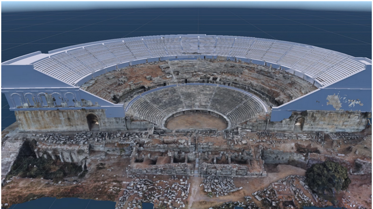
Figure 8: Foundations as evidence for a building (see https://www.csmc.uni-hamburg.de/research/cluster-projects/completed-cluster-projects/rfb02.html ).

The fact that the tentative display of the building in Figure 7 is indeed sensible is supported by very concrete foundation structures shown in Figure 8.