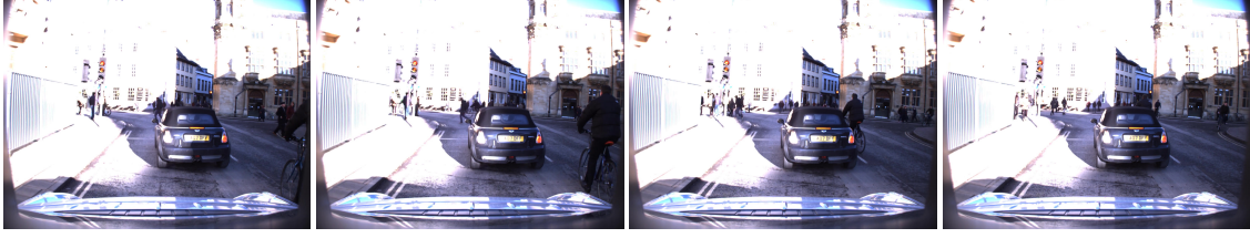
Figure 2: A bicycle approaches from behind the AV, overtakes it while the AV moves forward, and stops at a red light. It then continues to overtake a car that is stopped ahead of the AV at the traffic light.

is processed, the state vector is updated by multiplying it with the current transition matrix. Each column of the transition matrix represents the probability of transitioning into a particular state at a given frame. Because the transition matrix is computed from neural network outputs, which vary at every timestep, we consider our symbolic automata non-stationary. The final output is the state distribution after processing the last frame.