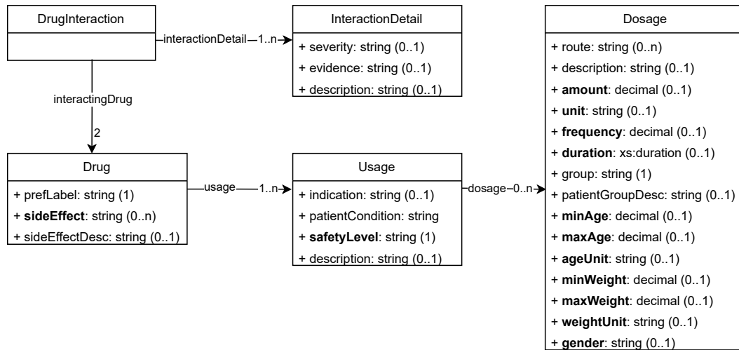
Figure 2: The UML class diagram for the Medicines Information ontology.

Also, we created auxiliary identifiers at various levels of the JSON documents to simplify the subsequent linking of different entities (see, e.g., the id field inside dosages).