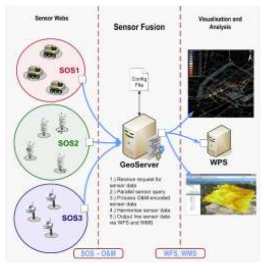
Figure 1: Sensor Fusion Service General Functionality.

The GEOSS AIP3 Energy Pilot where the GENESIS Technology was used to establish a set of WPS server/client pairs to provide information on the environmental impact of the production, transportation and use of photovoltaic panels. Figure 5 shows how the Client Portlet allows user to select input parameters and to graphically define points of interest. A video showing the Energy GEOSS AIP 3 pilot is available on the GEOSS AIP3 home page (http://www.ogcnetwork.net/pub/ogcnetwork/GEOSS/AIP3/index.html).