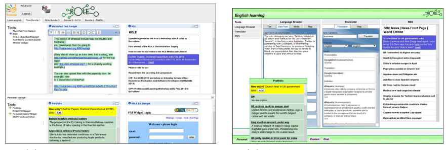
(a) Our initial implementation.