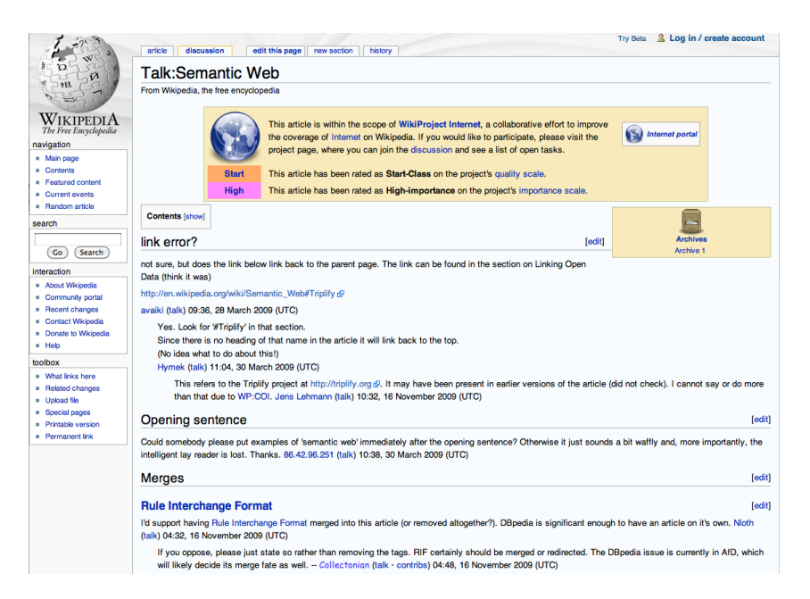
Fig. 1. Talk page for the Semantic Web article in Wikipedia

pages, using a lightweight ontology for Talk page comments which extends SIOC [2]. This markup and ontology provide underlying metadata which could later be used to highlight and query for certain types of Talk page comments.