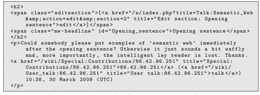
Listing 1.1. Example of a comment in a Talk page