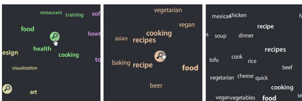
Figure 3. Hierarchical exploration in Semantic Cloud.

Furthermore, tags can be selected from the results list, which displays a set of popular tags with each found resource. All selected tags are highlighted in the tag cloud (if available in the currently displayed cloud) and furthermore appear in a compact list to the right of the cloud. They can be deselected directly within the cloud as well as in the list. An additional option provided in the list is (re)locating a specific query tag within the cloud by using the magnifying glass besides each tag. This can be particularly helpful when users have entered a query tag themselves and directly want to consult and select related tags without browsing the tag cloud hierarchy manually. Basically, queries are composed from the selected tags by applying the AND operator. Whenever the query selection is changed, the result list is updated. Hence, users are able to dynamically remove or replace tags while getting immediate feedback for their actions. They can consult results immediately and adjust their query if results are not yet appropriate. They can change focus of search at any time by replacing tags for related tags.