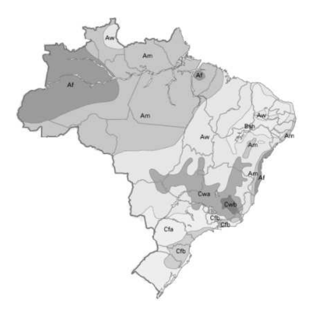
Fig. 1. Brazilian map with the Köppen climate distribution over the country.

Apache Lucene [8] search engine. The results show an enhance in precision for the same recall measures. The ontologies are considered as crisp ones where relationships between their own concepts assume values in the set \{0, 1\} denoting the existence (1) or absence (0) of the relationship between them. The relationships between distinct ontologies concepts are calculated as fuzzy ones.