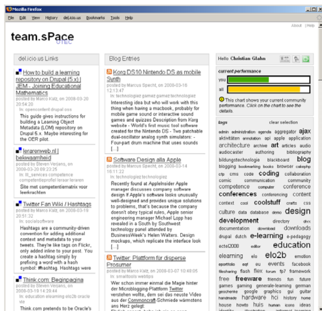
Figure 1 Screenshot of team.sSpace with authenticated user

For testing the contextual conditions for the adaptation strategy we removed the initially implemented adaptation strategy and made each indicator available only to one user group. The assignment of an indicator was static, which means that the users received only one visualisation of their interaction footprints for the entire period of the experiment. Apart from the different indicators about their interaction activity all participants used the team.sSpace in the same way. The modified version of team.sSpace has two indicators.