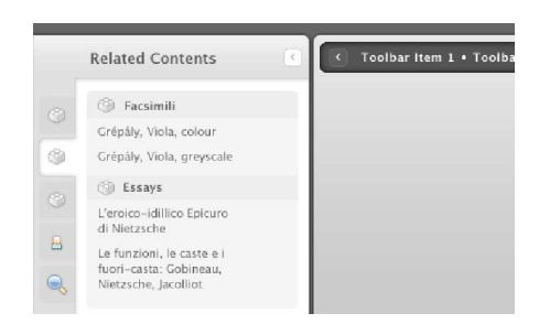
Fig. 2. Context sidebar in the Talia application

"Foreign" documents will be presented in the navigation in the same way as local documents. If the user follows a link to a foreign document, she will be taken to the other archive's site and she will be able to continue to browse there. If that side has accepted the contextualisation request, a back link to the original site will also be provided.