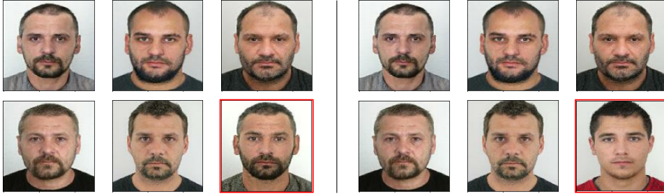
Figure 1: Examples of an unbiased (left) and a biased (right) photo lineups. For the sake of convenience, red borders denote a suspect (note that no such distinction is given in actual lineups). While the suspect’s on the left resembles appearance of other persons in the lineup, the suspect on the right considerably differs (younger, no beard). Images were generated by LiGAN tool and do not show real persons.

unlimited density and unlimited proximity to the user’s needs brings interesting theoretical challenges as well. In the next section we describe LiGAN application, while we briefly present some of the theoretical challenges in the discussion section.