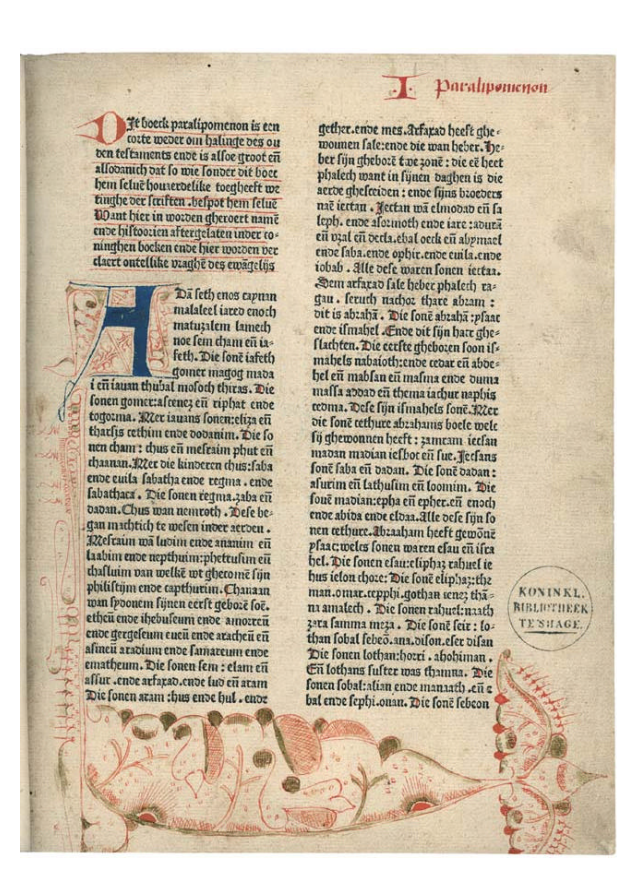
©Koninklijke Bibliotheek (http://www.kb.nl/) Den Haag, Koninklijke Bibliotheek, 169 E 56

The creation of the URI deserves special mention. When creating a URI we derive it from the real term identifier followed by the disambiguation signature and the thesaurus version. For example, in the Bibliopolis case the real identifiers are stored in field TWOND (and not NUM that contains