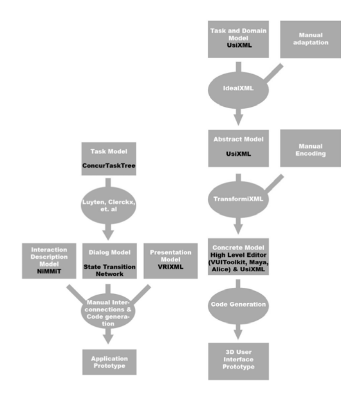
Figure 2: CoGenIVE (a) and Veggie (b) approaches

Once the Task Model is created it will be converted to a Dialog Model, denoted as a State Transition Network (STN). The STN is based upon Enabled Task Sets (ETS), which can be automatically generated from the CTT by means of the algorithm described by Luyten et al. [9]. Each ETS consists in the tasks that can be executed in a specific application state. Since we are developing Interactive Virtual Environments, we will only elaborate on the interaction tasks within the application. A possible example of such a task is object selection. In a typical form-based desktop application, selecting an item is a straightforward task in which the user selects an entry from a list. In an IVE however, this task becomes more complex because of the wide variety of selection metaphors (e.g. touch selection, ray selection, go-go selection).