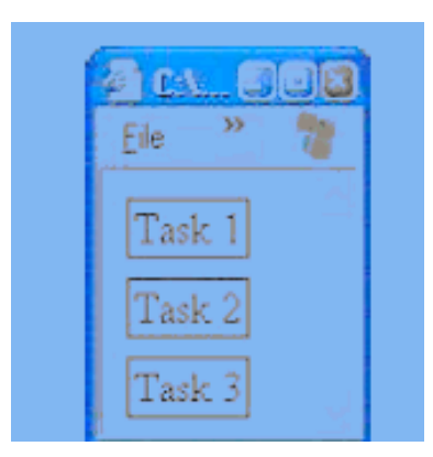
Figure 2. A container with three subtasks