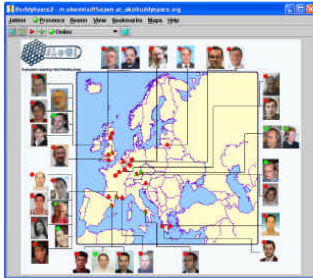
Fig. 1. BuddySpace showing presence (colored dots) and location information.