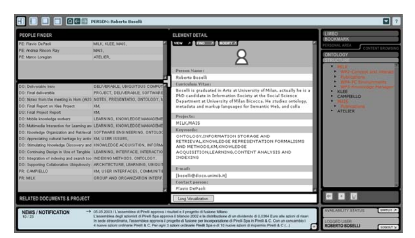
Fig.3 The MILK view with context interface

In the MILK project we have developed a new approach to interact with users [17]. With the traditional searching features, the MILK system provides the user with a discovery feature that fetches and shows information that is related to the current user activity and hence to the context. Discovery is addressed by the view with context , a metaphor realized in a profiling mechanism that binds elements of different nature together (Fig.3). On the screen, the element a user has retrieved (e.g., a document) is displayed surrounded by other elements that are similar to it (e.g., related documents, expert people and projects on the same subject). In such a way, users become aware of what is available and can discover novel information.