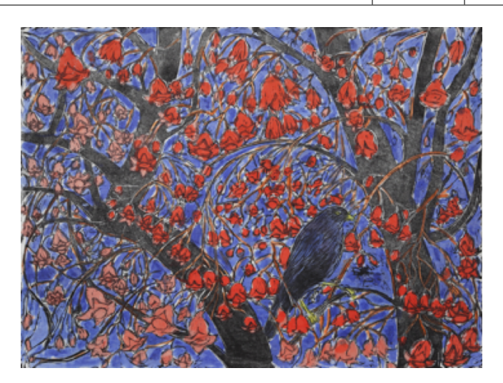
Fig. 2. "Illawarra Flame Tree and Bowerbird".

When considering what objects to show in a divergence, all the other objects represented by the 'pivot point' are determined, along with the total set of objects in prior convergences. Based on the object depicted in its pivot point, an object concept is constructed, in which a set of formal concepts containing that object are retrieved. Using concept similarity metrics, the formal concept that is selected is the one that has the highest similarity score containing objects not part of a prior set of convergences. These new objects are then reconstructed as a formal concept, so that any additional attributes are implied from this reduced set, which is then presented as an adjoining pathway from the pivot point.