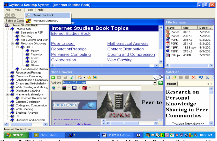
Figure 2. This figure shows a screenshot of the MyBooks Desktop Software with an open mybook-object containing research papers and resources organized for a Computer Science seminar course on Internet Studies.