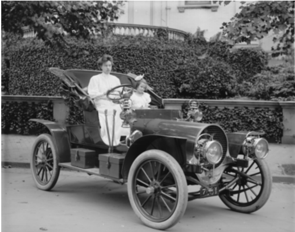
Figure 1: 1907 Franklin Model D roadster.